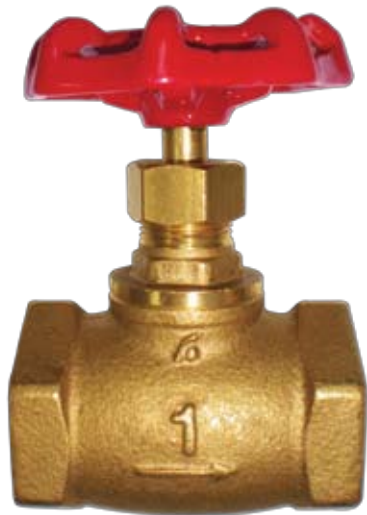
BRASS FIG : F1131 BRONZE FIG : F1231

Test pressure : Shell 300 PSI (20.7bar) (Hydrostatic) Seat 200 PSI (13.8bar) (Hydrostatic)